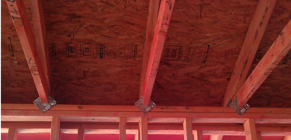
Figure 1. TECHWOOD 4400 Product

4.1 The product evaluated in this TER is shown in Figure 1 and Figure 2.