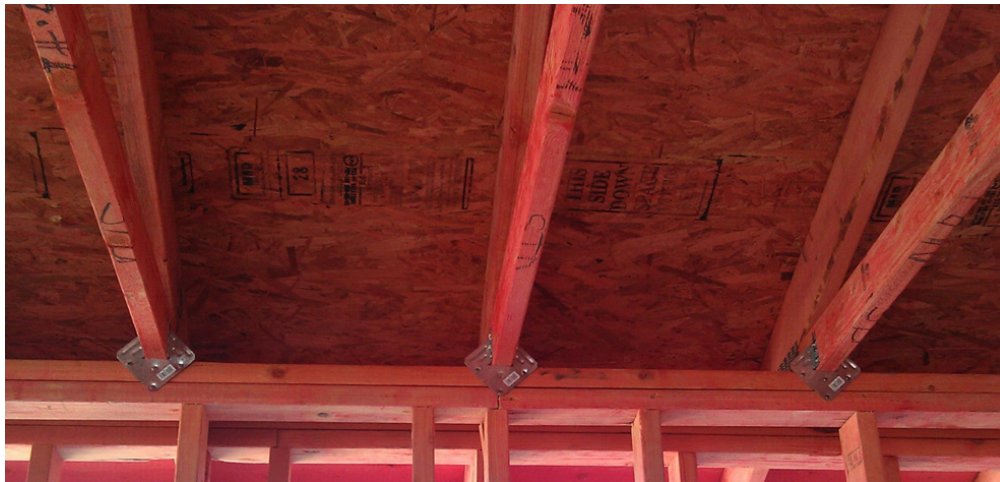
Figure 1. Techwood 2200 Product